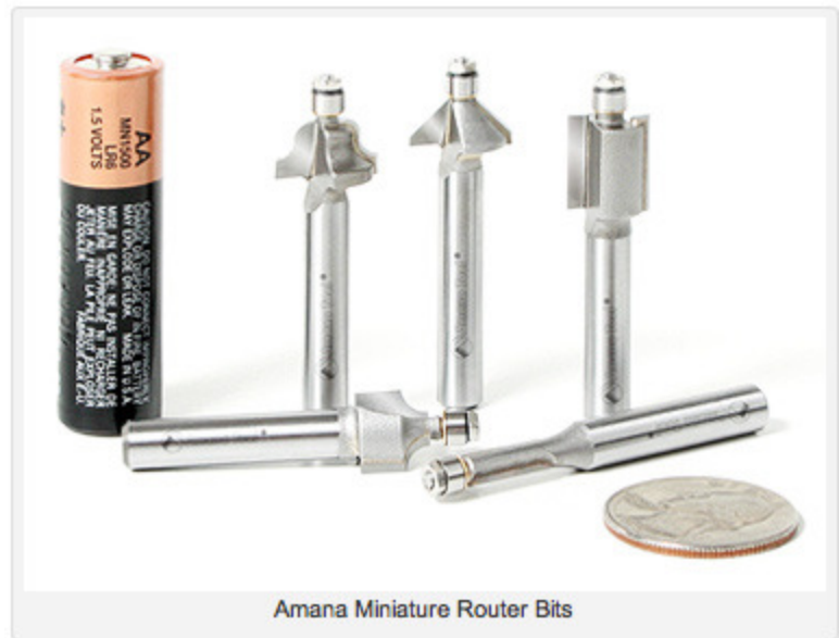
Amana Miniature Router Bits

The profiles may be no different to the other common ones in your router bit set, but the size will make a big difference in what you can achieve, in situations where you would have had to find an alternate (and often with a compromised finish) option.